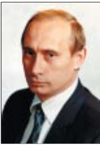
His Excellency Vladimir Putin